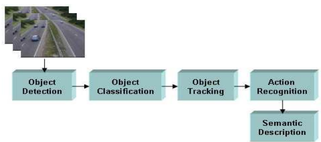
Fig 1: A generic framework for smart video processing algorithms.

A generic video processing framework for smart algorithms is shown in Fig 1. This framework provides a good structure for this survey.